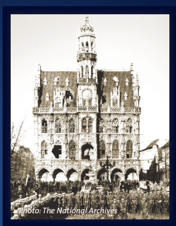
91st Division soldiers assemble at the Town Hall (Hotel de Ville), Audenarde. November 12, 1918.

The 37th Division reached the Scheldt River on November 1 and crossed on November 2. The 91st Division entered Audenarde on November 2 and 3.