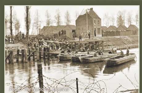
Soldiers of the 316th Engineers build a pontoon bridge over the Scheldt River. Audenarde, November 1918.