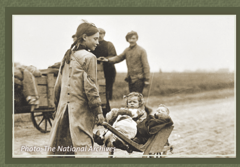
Belgian refugees walking toward Waregem, returning to areas liberated by American units. November 2, 1918.

American casualties from fighting in this region are interred at the Flanders Field American Cemetery in Waregem.